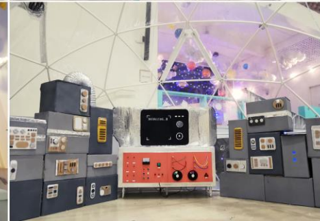
Entire Space – The Curious Sky : Galaxy Edition (Current installation)